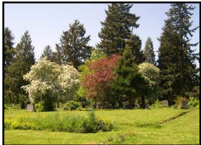
Hawthorne and Red Oak Trees in Bloom Near the Brabham Lot.