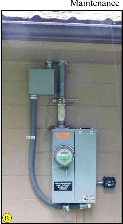
NEW ELECTRIC METER/BOX On South Side of Maintenance Building