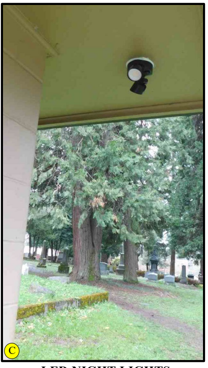
LED NIGHT LIGHTS On the Front Corners of Building