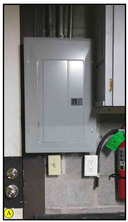
NEW CIRCUIT BREAKER PANEL Inside the Maintenance Building

Major items replaced/upgraded included: (A)The Inside Circuit Breaker Panel; (B)The Outside Meter & Electrical Box; Room Light & Switch in the Hand-Tool Storage Room. In addition, (C)LED Lights that come on each night were installed on both front corners of the Maintenance Bldg.