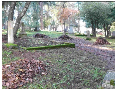
Raking up Fall Leaves (December 16 th , 2023)