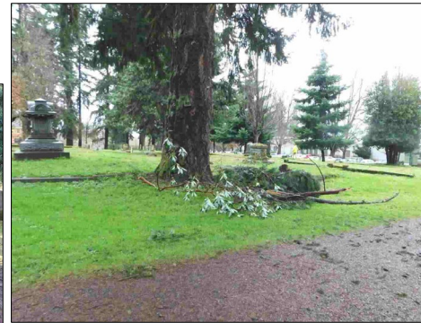
Picking Up Downed Limbs – after the Horrific Ice Storm (January 22, 2024)