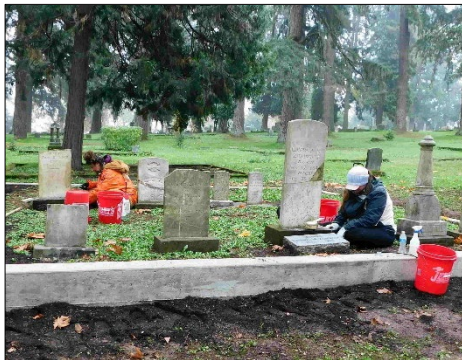
Cleaning Markers on the Zumwalt Lot (November 18 th , 2023)