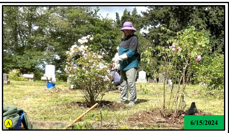
DURING — Rose Care in the Cemetery

A hearty "Thank You" to all the individuals who give of their time and energy to take good care of these lovely, fragrant, and priceless treasures from the past!