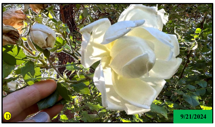
STILL BLOOMING IN SEPTEMBER! — "Moon" Rose