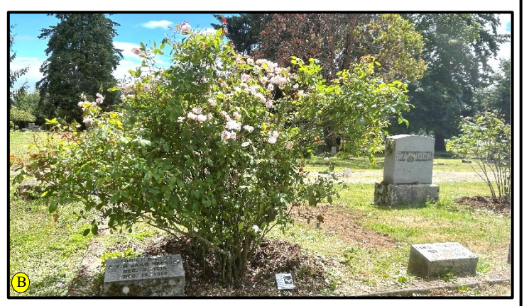
AFTER — Rose Care in the Cemetery