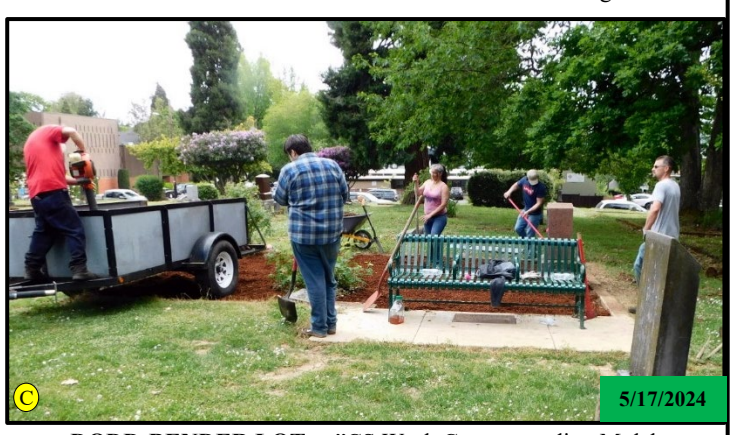
DODD-BENDER LOT – "CS Work Crew spreading Mulch